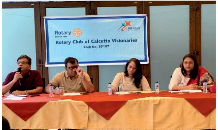
Our club's First Board Meeting 24-25 held on Sunday, 25th August at 11 am, at The banquet hall of Calcutta Swimming Club.